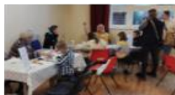
The activities in the hall

Company Advent calendar which includes a story book of the real meaning of Christmas.