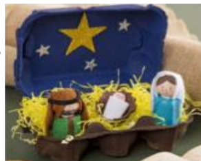
An egg box nativity