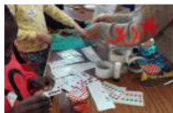
Making the blessings jars

In January we looked at the story of Jesus being presented in the temple to Anna and Simeon, which has come to be celebrated as Candlemas. (Luke 2 v 25 –38). Activities included making a 'blessings jar' full of heart shapes with messages on them such as 'You are loved beyond measure' from